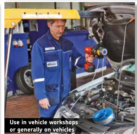
Use in vehicle workshops or generally on vehicles

Loads of up to 300 kg (even up to 600 kg with a sheave) can be lifted, dragged or lowered with the PULLEYMAN. Thanks to its innovative technology and patented "self-locking" planetary gear, the PULLEYMAN is particularly versatile and safe in use. Whether for use in factories, for installation or maintenance work, in agriculture or forestry, in vehicle workshops, on building sites or even for domestic use, the PULLEYMAN is a practical assistant everywhere which is always simple to operate and ready for