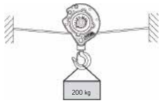
Fixed rope, moving PULLEYMAN, load direction horizontal and inclined

A tool, capable of lifting or lowering objects, independent of electricity and operating only with a battery-powered screwdriver? Can be used as a hoist in factories and forestry operations, or as a crane on construction sites, for house-building or in car and truck service stations e.g. for lifting the engine block out of a vehicle - the uses of a tool of this nature are almost infinite and will make life easier in very many trades. The good news: A tool like this already exists!