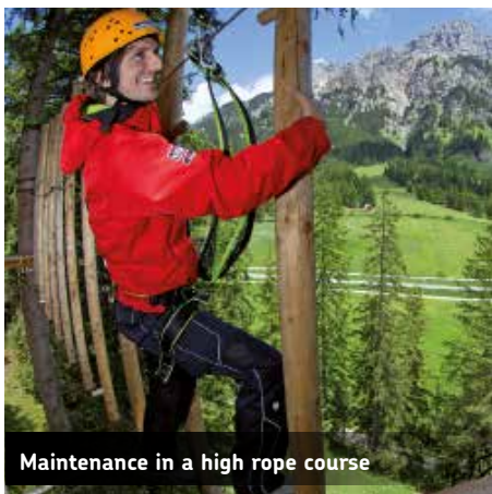
Maintenance in a high rope course