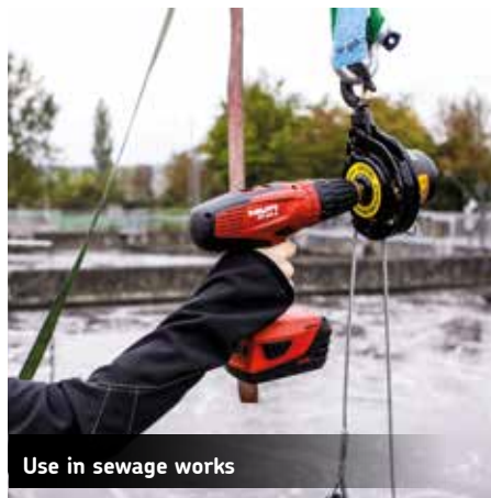
Use in sewage works