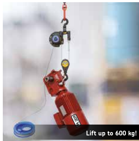
Lift up to 600 kg!