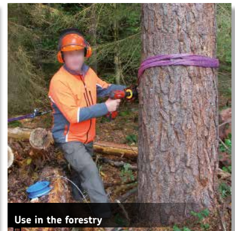
Use in the forestry