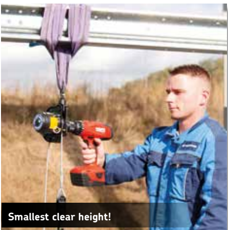
Smallest clear height!