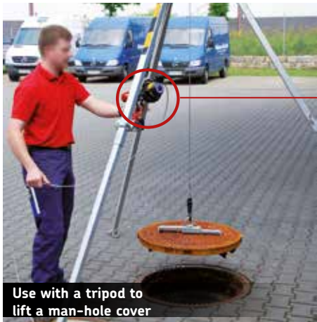
Use with a tripod to lift a man-hole cover