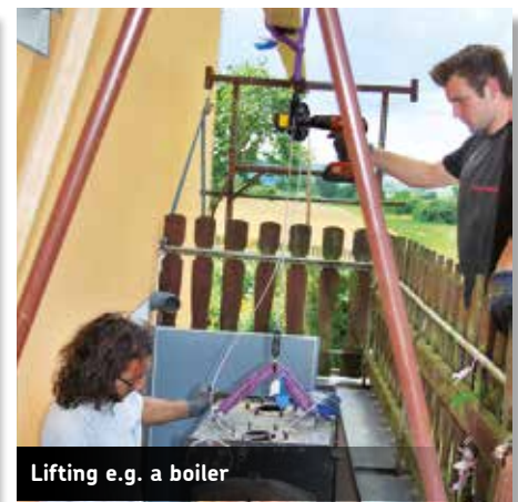
Lifting e.g. a boiler