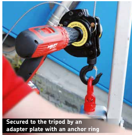
Secured to the tripod by an adapter plate with an anchor ring