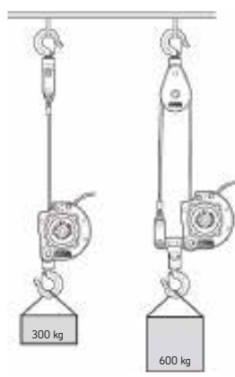
PULLEYMAN with fixed lifting hook